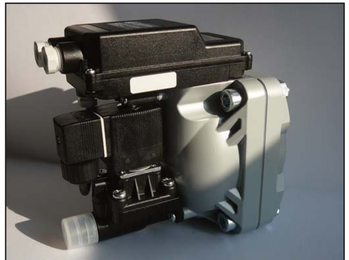
Condensate drain without compressed air loss